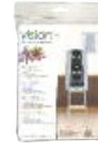
VISION® M02/M12 Night Cover ART. 83282 For Vision® models M02/M12