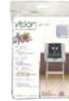
VISION® M01/M11 Night Cover ART. 83280 For Vision® models M01/M11