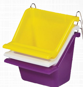
Seed Cup - Medium (9 x 8cm)