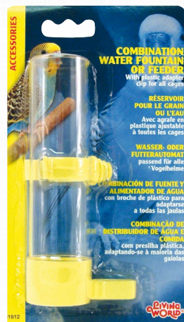
Living World Water Fountain/Feeder Code - 81612