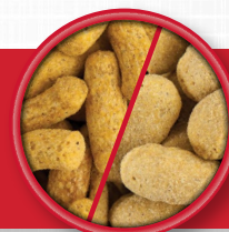
STICKS / BISCUITS