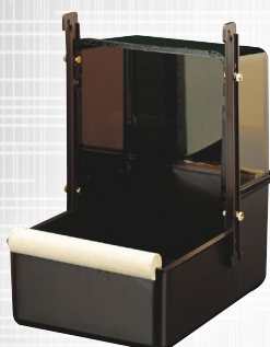
Cockatiel Bird Bath