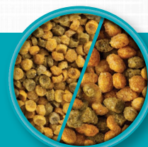
2 MM / 4MM