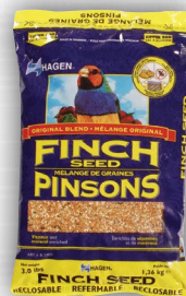
FINCH STAPLE VME SEED B2403 (1.36kg)