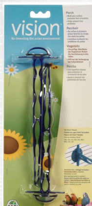
Blue Perch (small/med cages) Code - 83400