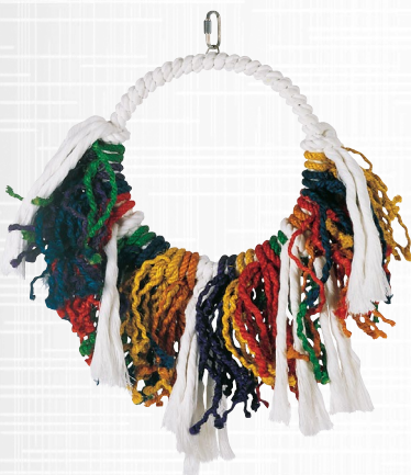
Junglewood Dream Catcher Bird Toy Code - 81174