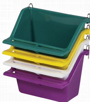
Seed Cup - Large (11.5 x 9cm)