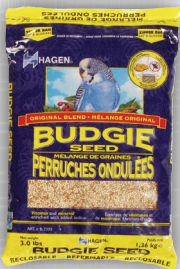
BUDGIE STAPLE VME SEED B2203 (1.36kg)

The seed diet is supplemented with essential vitamins and minerals to ensure the finest possible nutrition for your pet bird. This fortified seed mixture can be used as the main diet for extended periods of time to add variety and interest.