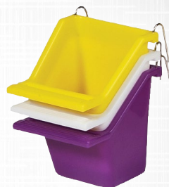
Seed Cup - Small (6 x 8cm)