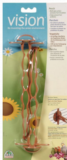
Terracotta Perch (for large cages) Code - 83420