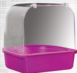
Outside Bird Bath - large