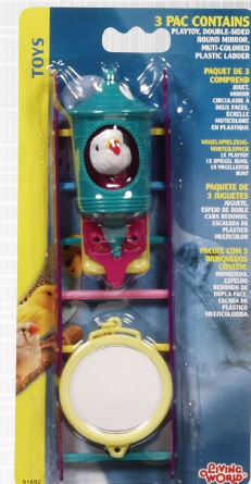
Bird Toy Value Pack Assortment 2 Code - 81692