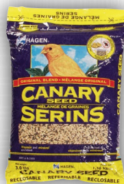
CANARY STAPLE VME SEED B2303 (1.36kg)