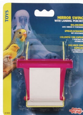
LW Mirror Swing Code - 81660