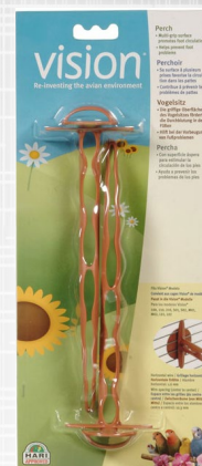
Terracotta Perch (small/med cages) Code - 83410