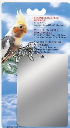
Bird Mirror Code - 81451