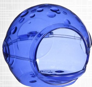
Vision Bird Bath