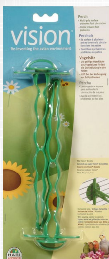
Green Perch (for large cages) Code - 83415