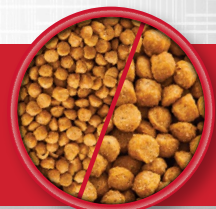
2MM / 4MM