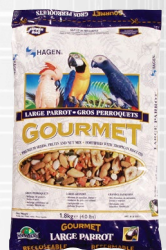
PARROT GOURMET SEED B2821 (1.8kg)