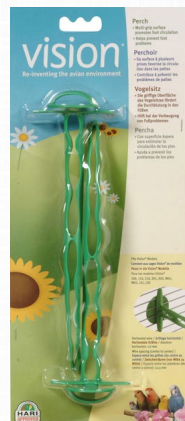
Green Perch (small/med cages) Code - 83405