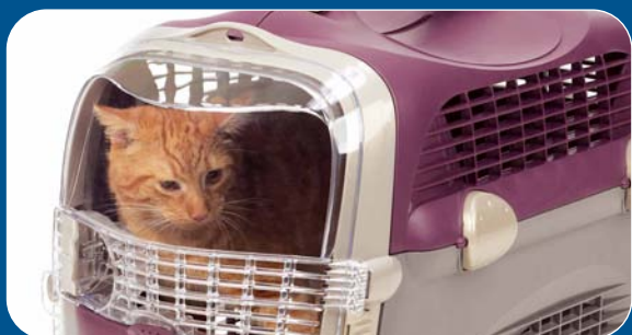
Clearview Front Door