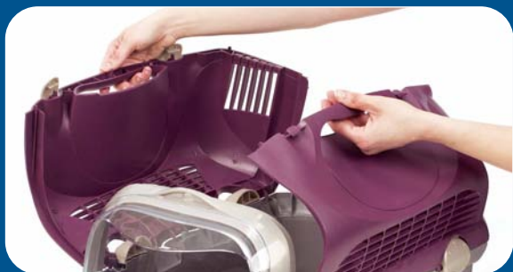
Opening Top Hatch